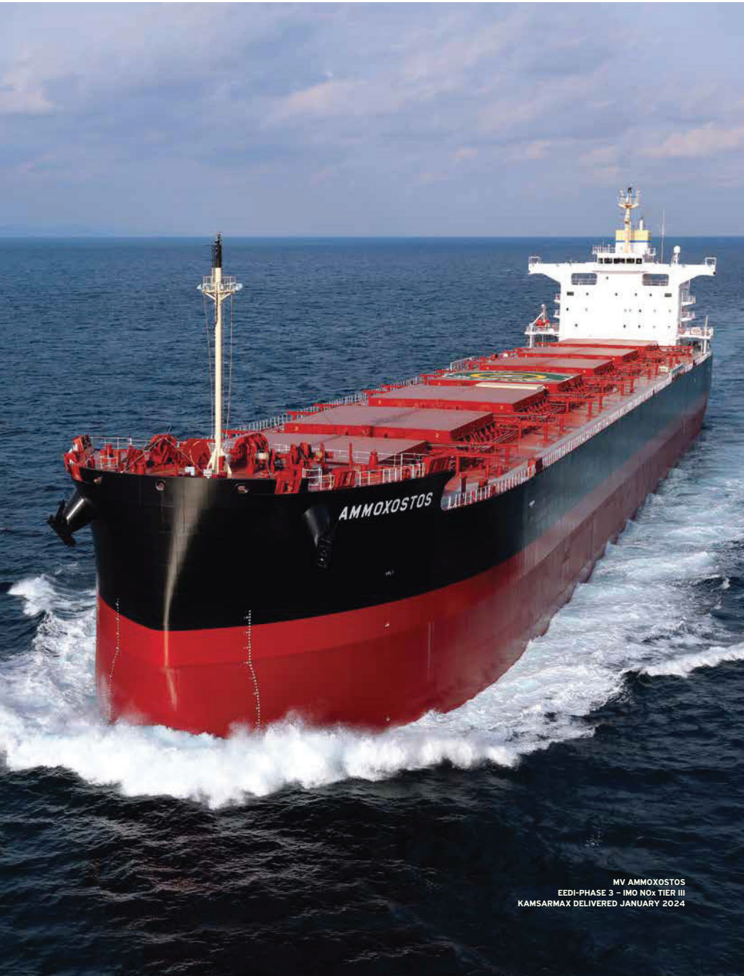
MV AMMOXOSTOS EEDI-PHASE 3 – IMO NOx TIER III KAMSARMAX DELIVERED JANUARY 2024

Safe Bulkers, Inc. is a global shipping company providing worldwide seaborne transportation trade in the dry bulk sector. We are listed in the New York Stock Exchange and our shares trade under the symbol "SB", "SB.PR.C" and "SB.PR.D". We have offices in Monaco, Greece, Cyprus and Switzerland.